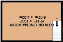
BASEMENT 253 sq. ft. (24.4 sq.m.) approx.