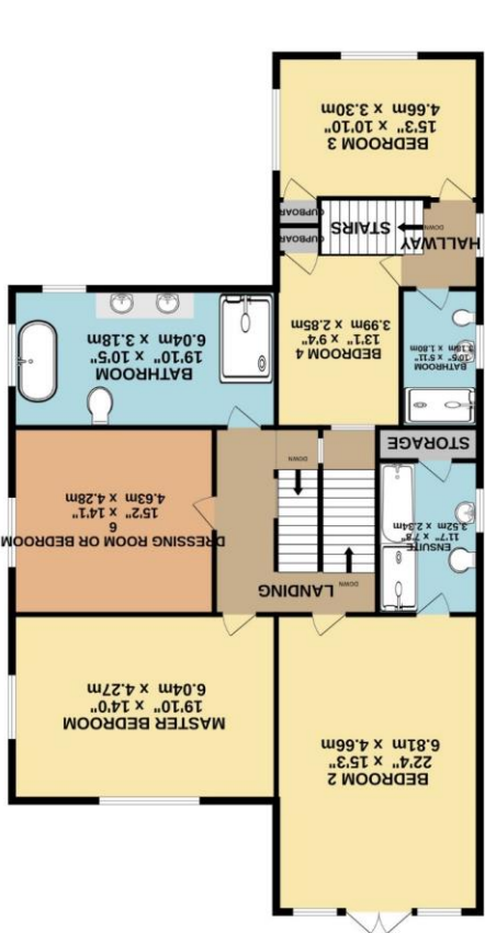
1ST FLOOR 1743 sq. ft. (162.0 sq.m.) approx.

Whist every attempt has been made to ensure the accuracy of the floorplan contained here, measurements of doors, windows, rooms and any other items are approximate and no responsibility is taken for any error, omission or mis-statement. This plan is for illustrative purposes only and should be used as such by any prospective purchaser. The services, systems and appliances shown have not been tested and no guarantee as to their operability or efficiency can be given. Made with Metropix ©2025